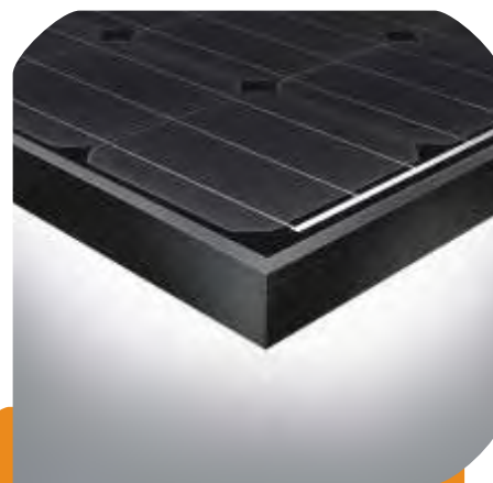
Certus Max 270 - 285Wp