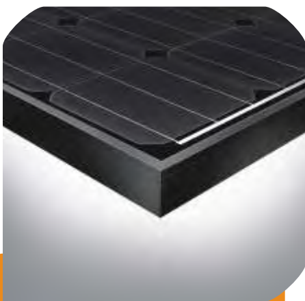
Certus 190 - 315Wp